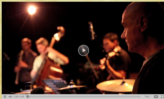
Video Side 1