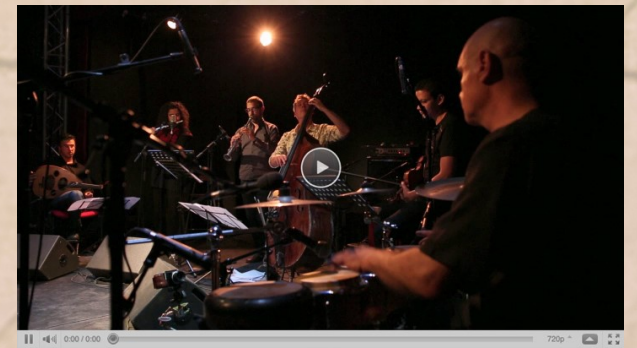
Video Side 2